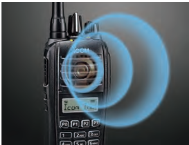
1500 mW powerful audio