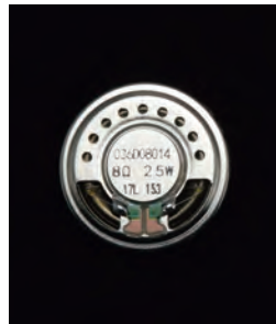
Icom custom high power handling capacity speaker