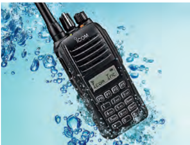
Waterproof for 30 minutes in one meter depth of water