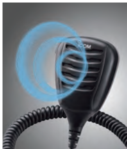
1500 mW powerful audio with optional HM-222HLWP