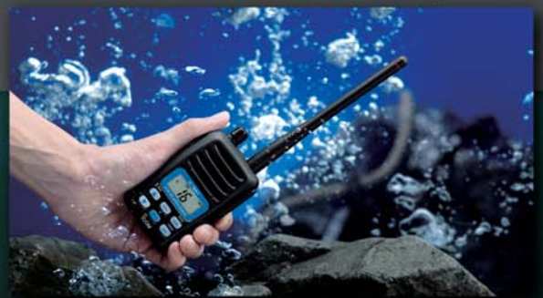
Photo includes optional speaker-microphone, HM-138.